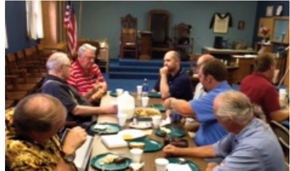
Attendance at the August meeting was good!

A revision to the By-laws was presented. After a little discussion members agreed that the revised wording be sent to membership for review. Current by-laws state that any revised By-laws changes must be provided to all members at least 10 days prior to the next stated meeting. Our next stated meeting is August 11, 2015. Therefore, the following by-laws change will be voted on at the September 8, 2015 meeting.